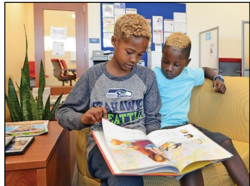
Response to the Mariner Library reflects the desire of area residents for services and a gathering place.

Total project cost will depend on a combination of costs related to land acquisition and construction as well as the services provided and service levels.